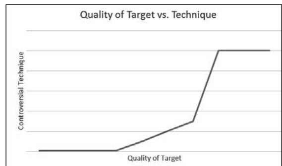
Figure 2. Quality of Target vs. Technique

are along the sidelines as opposed to integral members of the opposing team. Integral players (vital espionage targets) have access to secrets with the greatest potential to damage U.S. national security.