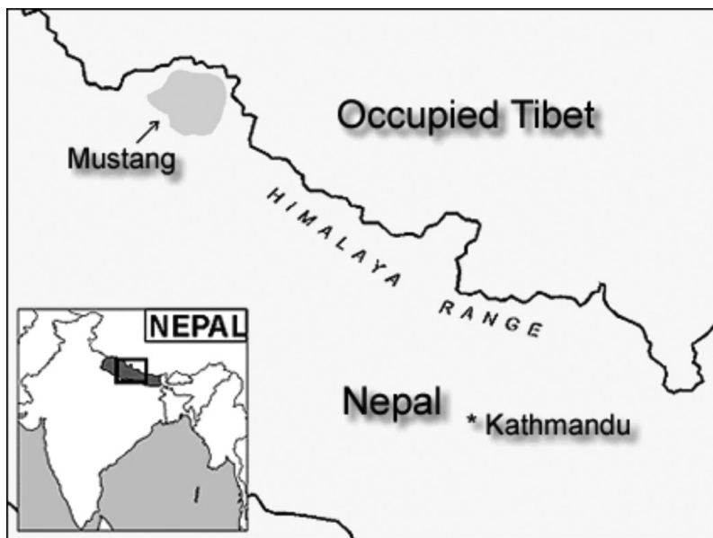
Figure 3. Mustang Kingdom in Nepal

along the border primarily in central and western Tibet for the purpose of intelligence collection. Finding little support among the local population, most of the teams returned to India within weeks. By 1967 the CIA terminated this mission as it became evident that the risks were not worth the scattered intelligence the teams were delivering. 32